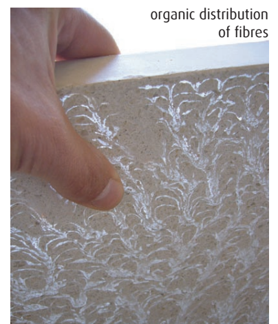
organic distribution of fibres