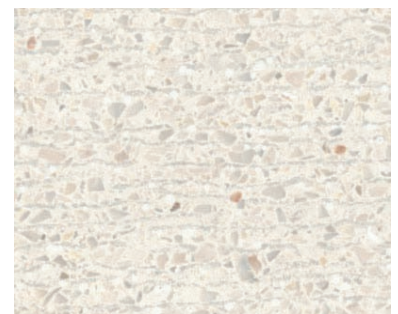
white (Cserhát C/D4)